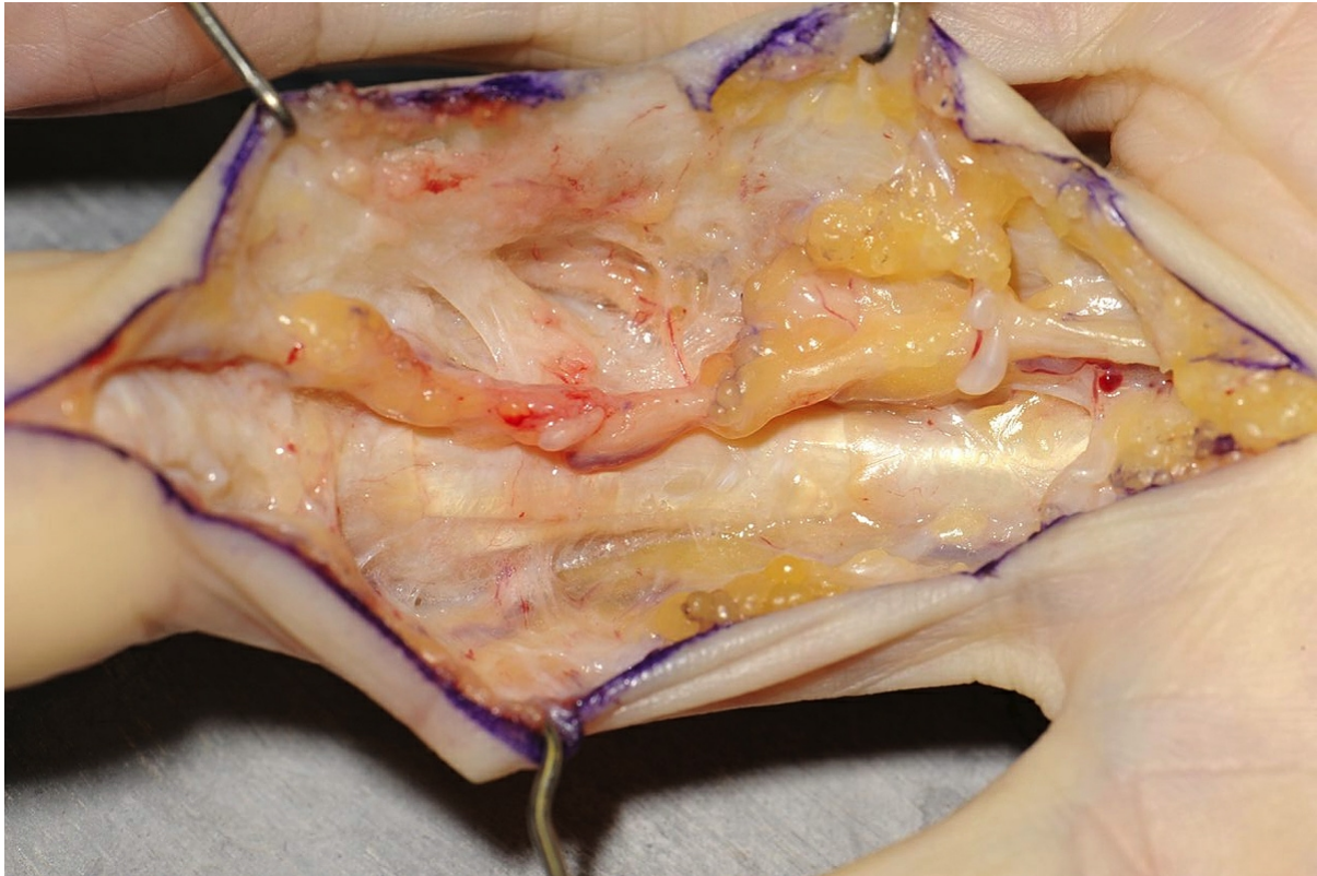
Figure 1: In this dissection disease has been removed from the radial side of the ring finger. Cleland's ligament can be seen extending from the side of the middle phalanx into the skin and, in contrast to the ligament on the other side of the digit, is involved with Dupuytren's Disease. The neurovascular bundle, associated with several Pacinian corpuscles, can be seen overlying it.

Once the disease has been split longitudinally, each half of the disease can be dealt with separately and the digital neurovascular bundles can be identified on each side, before resection of the disease. The surgeon sits at the hand table facing the disease being dissected, changing sides as necessary. If the bundles are identified proximal and distal to the disease on each side, these structures can be followed using sharp dissection to divide the disease, which lies over them. Once the bundles have been identified throughout the length of the dissection the disease is excised. A specific dorsal retro-vascular dissection is made just distal to the PIPJ to identify the Cleland's ligaments on each side. These, which are often involved with disease and may contribute to the contracture, are excised (Figure 1).