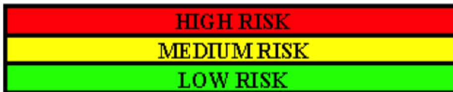
Table 2: Risk matrix

Thus with the treatment of DD, a risk such as an allergic reaction to CCH is very rare but potentially catastrophic; a skin tear with PNF is very common but of no clinical consequence (Table 3). So patients must be carefully advised about the potential risks of their treatment and they must provide their written consent